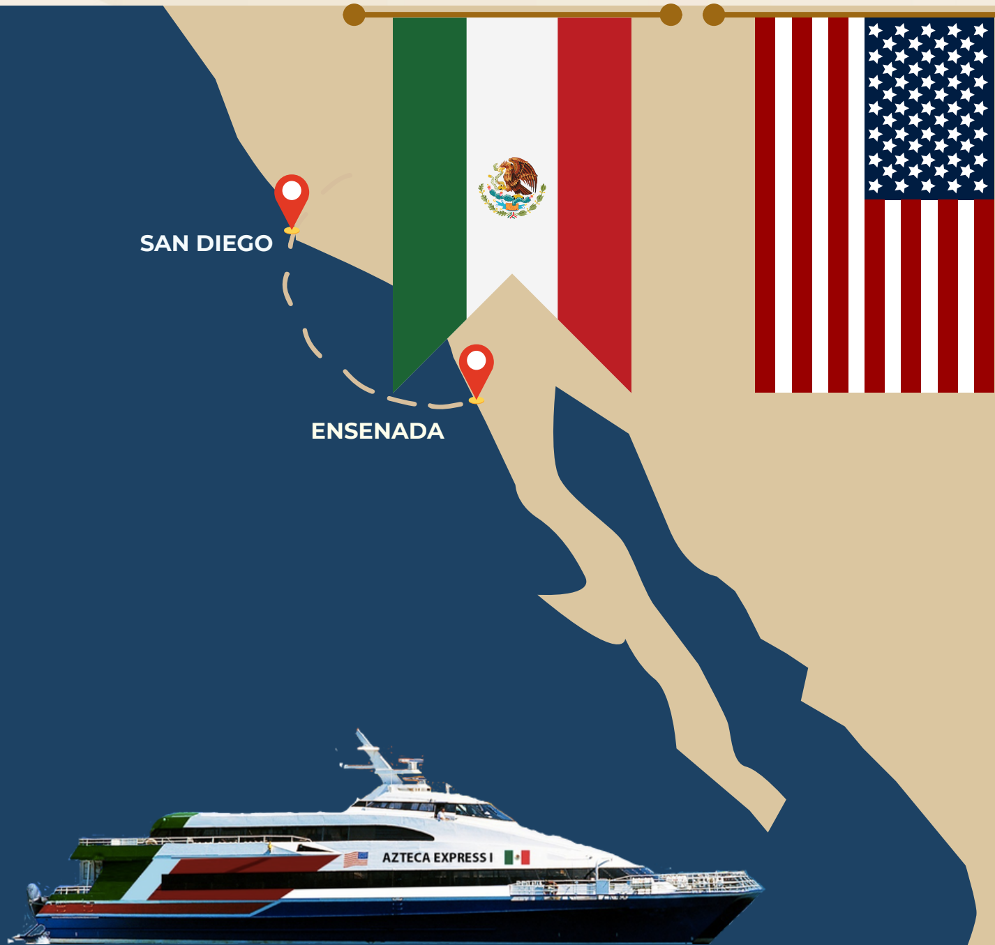
1. Upcoming passenger ferry between Ensenada & San Diego.

2. Analysis of cargo movement between Florida and Mexican ports, with an additional exploration of potential involvement of ports in Louisiana.